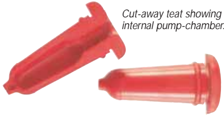
Cut-away teat showing internal pump-chamber.

Excal teats are manufactured from a unique blend of natural and synthetic elastomers specially formulated to optimise the physical properties of each. The result is an exceptionally durable product with excellent U.V. and ozone resistance, but still retaining full natural flexibility.