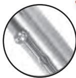
QRS button for easy length adjustment