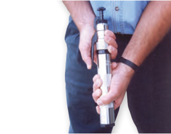
Firearms licence is not required for this tool.