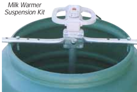
Milk Warmer Suspension Kit

Hook and loop type nylon bands for quick and easy calf identification, whether for identity at birth, or for signifying treatment with antibiotics or sulphur drugs. Also useful for marking different age, rearing or treatment groups. Washable and reusable. Highly visible neon colours. 59cm long. 2.5cm wide. Pack of 10 only.